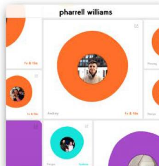
PHARRELL WILLIAMS WEBSITE

How to use: Use this Knowledge Organiser to identify the similarities and differences between the music video and the website